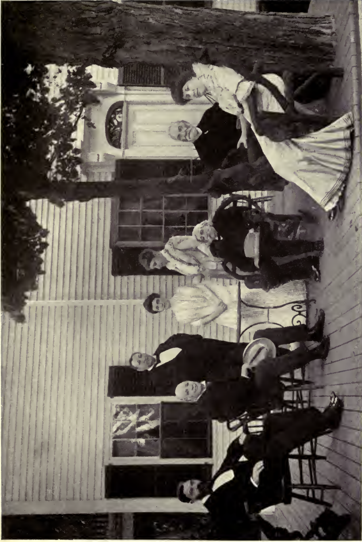
AT BRUNSWICK, MAINE, 1902